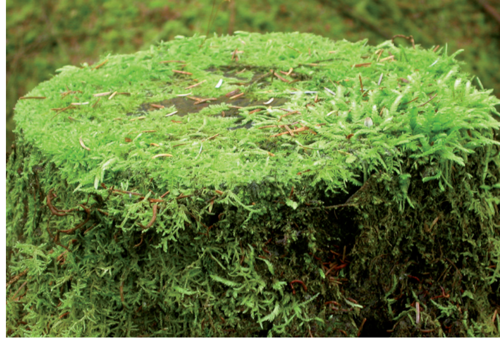
Daltonia splachnoides on the move

Daltonia to exploit what is a relatively recent arrival in habitat terms. The forest cover of Ireland in early postglacial times did include an important coniferous component, with extensive tracts dominated by Pinus sylvestris , especially in western regions, although 20th century plantations have a dense canopy of spruce which creates a darker and more humid forest microclimate than that found under Pinus sylvestris . A major Pinus decline began around 4,000 years ago and the species is generally believed to have died out sometime in the 1st millennium A.D. (Roche et al. , 2009). The overall deforestation of the Irish landscape began with Neolithic clearances; Rackham (1995, 2005) has estimated that by 1650 A.D. the total