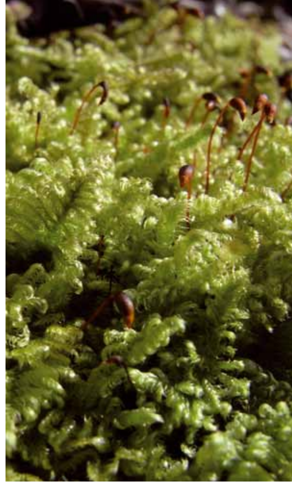
△ Fruiting Ctenidium molluscum at Cotgrave Woods. Robin Stevenson

After the Skylark site they moved on to Cotgrave, where they looked at the Church and cemetery (SK63M) and some nearby woodland (SK63L). The 34 species recorded from the cemetery included Dicranum scoparium , Didymodon luridus , Didymodon tophaceus , Orthotrichum anomalum and O. cupulatum . Syntrichia virescens was