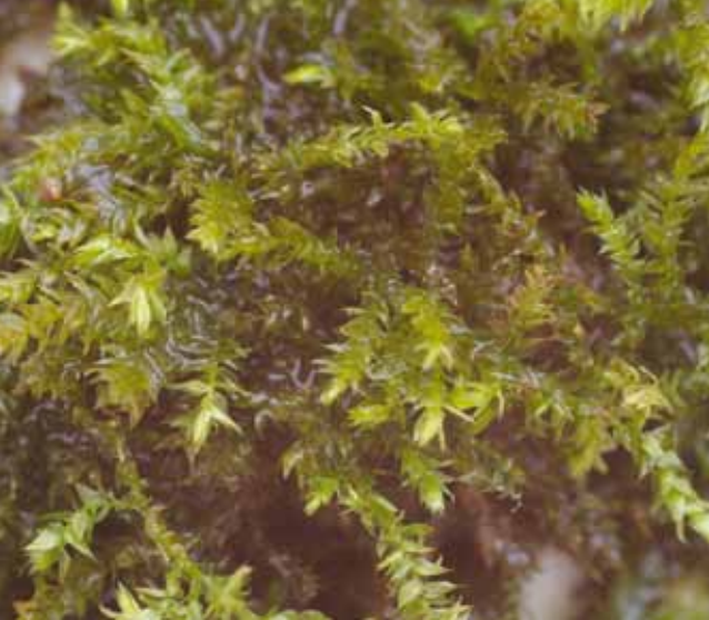
△ Oxyrrhynchium speciosum on the banks of the River Witham.