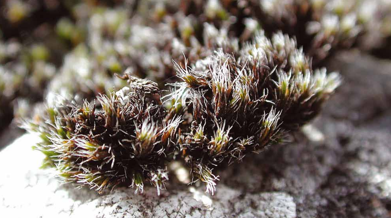
△ G. elatior (15).