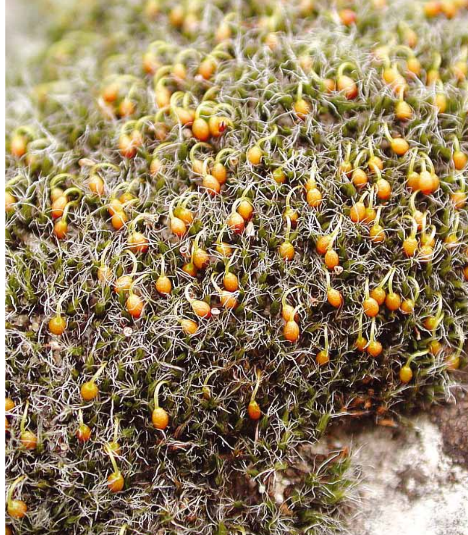
<1 G. orbicularis (23).