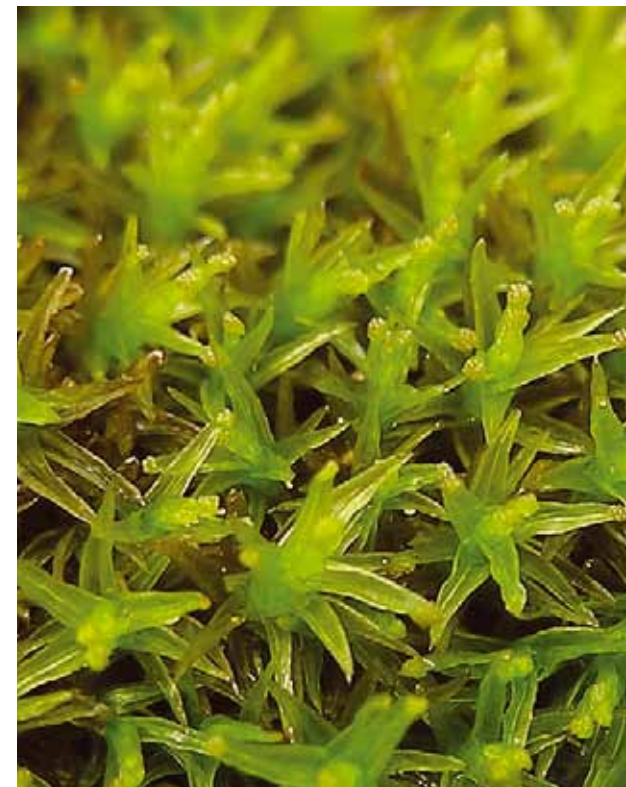
▽ G. meridionalis (19).