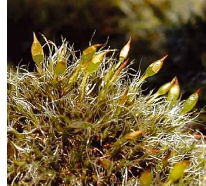
△ G. montana (20). Michael Lüth

row ascending to above widest part of leaf where the cells become short-rectangular to quadrate; lamina cells there rectangular or elongate-rectangular, walls strikingly or only weakly sinuose; costa in transverse section rounded dorsally at leaf base, strongly prominent dorsally in laminal part of leaf, occasionally weakly mamillate, hydroids present from base to mid-leaf, costal cells uniform in upper part of leaf. Calyptra mitrate, beak conical, obtuse . . . . . G. elongata (11)