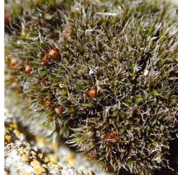
△ G. anodon (2). Michael Lüth

19* Paracostal cells at leaf base elongate-rectangular, walls mostly smooth, near margin 3–4 rows of narrowly rectangular, hyaline, thin-walled cells, gradually vanishing, the outermost