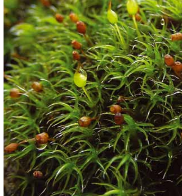
△ G. ovalis (24).