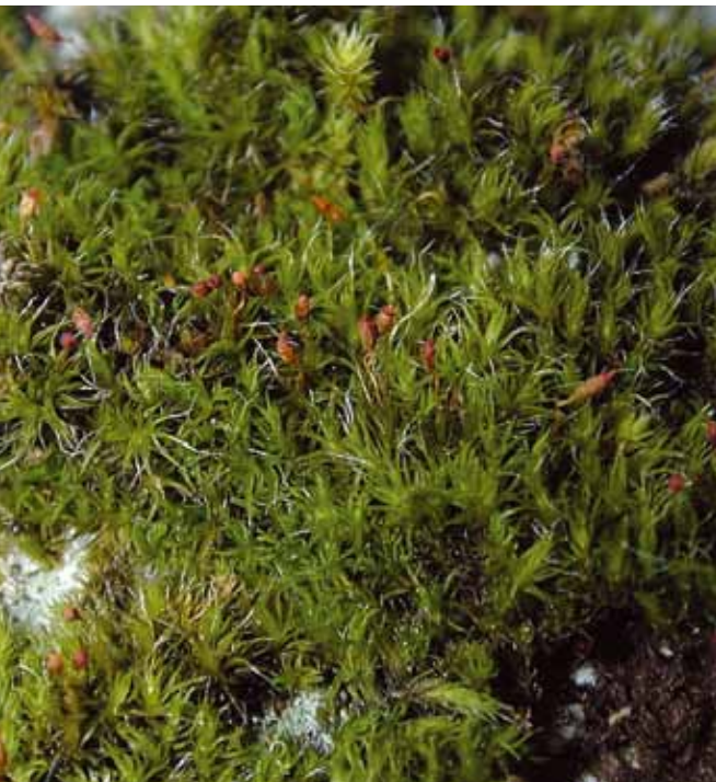
▽ G. crinita (6).