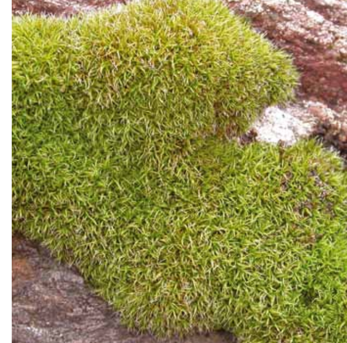
△ G. lisae (17).