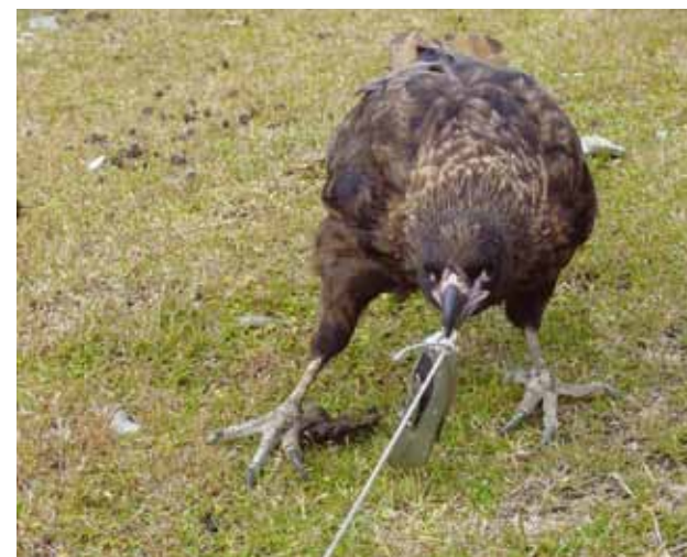
△ Hazards in the Falkland Islands. (Top) Minefields, a legacy of the war with Argentina. (Middle) Our bogged down Land Rover. (Bottom) The camera case thief – a striated caracara.