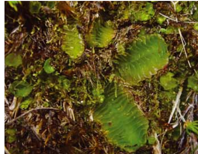
△ (Above) Striking Falklands liverworts. (Top left) Marchantia berteroana the only native complex thalloid liverwort. (Top right) Jensenia (Pallavicinia) xiphoides. (Bottom left) Lepicolea ochroleuca. (Bottom right) Pachyschistochila leucophylla.