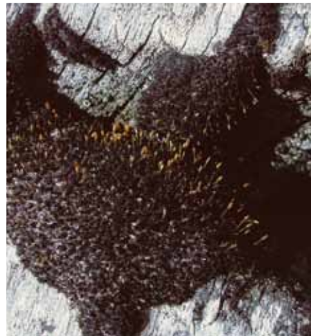
< Some interesting mosses. (Top left) Dendrotrichum squamosum . (Top right) Rhacocarpus purpurascens . (Bottom left) Conostomum magellanicum (new to the Islands) growing with Balantiopsis . (Bottom right) Undescribed species growing on shipwreck timber dating from the 1920s. J.G. Duckett