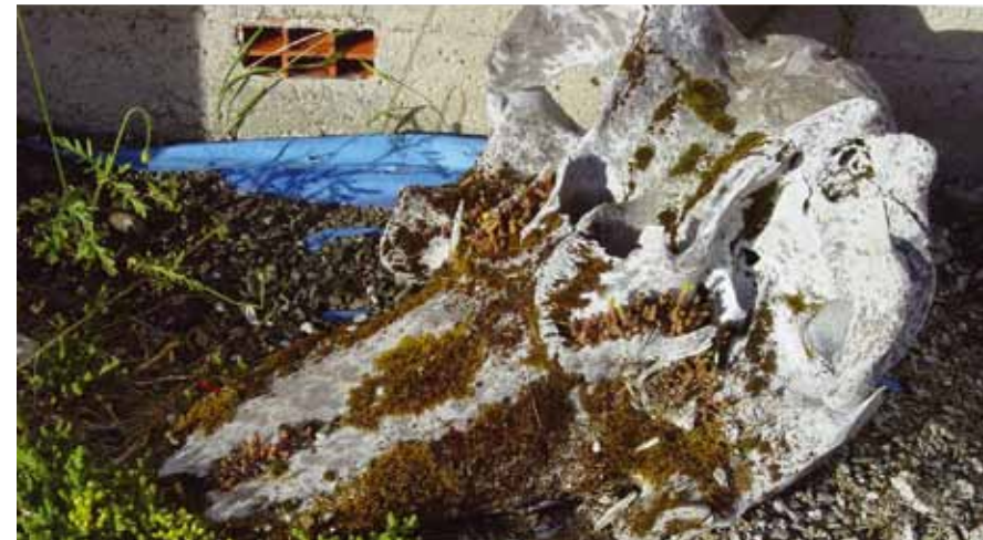
< (Top row) Tetraplodon mnioides , the first member of the Splachnaceae found in the Falklands. (Bottom) Whale bones support several Syntrichia species, including S. papillosa and S. subpapillosa (new to the Islands), better known as epiphytes elsewhere in the world. J.G. Duckett

very few bryophytes with young sporophytes at the height of the Falklands summer suggests that spring expeditions will be optimal for gaining the first insights into reproductive cycles on the islands and the possible discovery of more spring ephemerals. The latter proved to be the case for the 2006 expedition to south Chile which resulted in several mosses new to South America, including the bipolar moss Pterygoneurum ovatum (Matcham et al. , 2007; Ochyra et al. , 2008). It is therefore of particular interest that in the Falklands spring of 2010 Rebecca found Pterygoneurum ovatum new to the Falklands on offshore New Island where sheep grazing is absent. Future spring visits to New Island and other offshore islands where sheep are absent could well reap rich rewards bryologically.