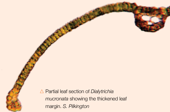
△ Partial leaf section of Dilytrichia mucronata showing the thickened leaf margin.

Having experimented with various techniques over the years I have settled on one that works very well for me (I am right-handed) using a