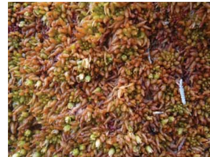
△ Sphagnum austinii from Co. Galway (v.-c. H17). Jo Denyer

1.7. Sphagnum teres . H7 : basic flush on hillside, 410 m alt., north-facing slope below Lough Muskry, Galtee