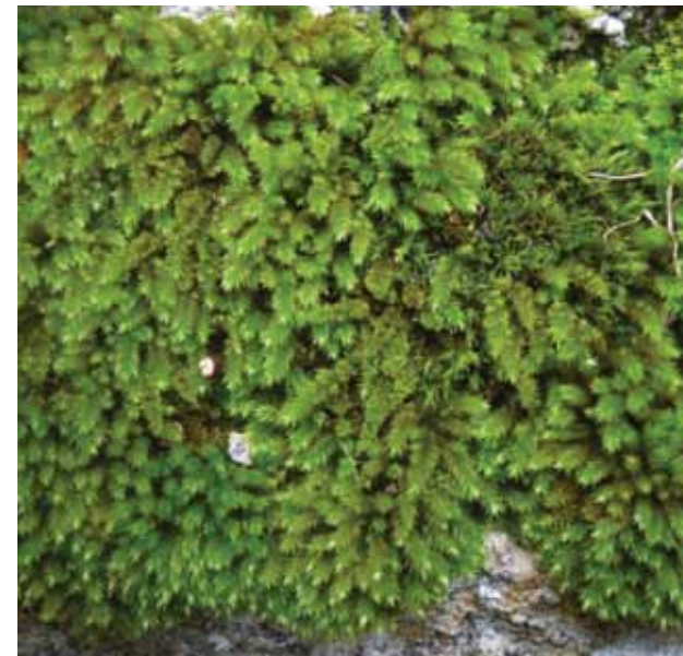
△ Leucodon sciuroides from Donadea Demesne, Co. Kildare (v.-c. H19). Jo Denyer

214.2. Isothecium alopecuroides . H19: on trunk of sycamore, ca 105 m alt., Mooreabbey Demesne, Monasterevin, N6309, TL Blockeel 40/515, JL Denyer et al.