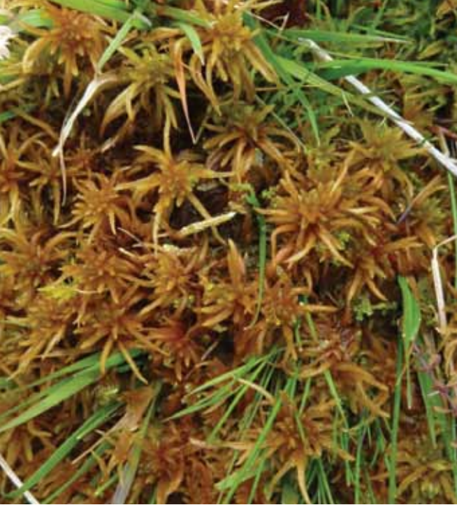
△ Sphagnum teres from Lough Muskry, Galtee Mountains, Co. Tipperary (v.-c. H7).