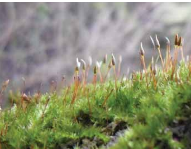
△ Pylaisia polyantha with its usual abundance of capsules, Bonsall, Derbyshire (v.-c. 57).

Ephemerella readeri is now known from a second station, in North Devon, where it was found in 2004, a long way from its Yorkshire