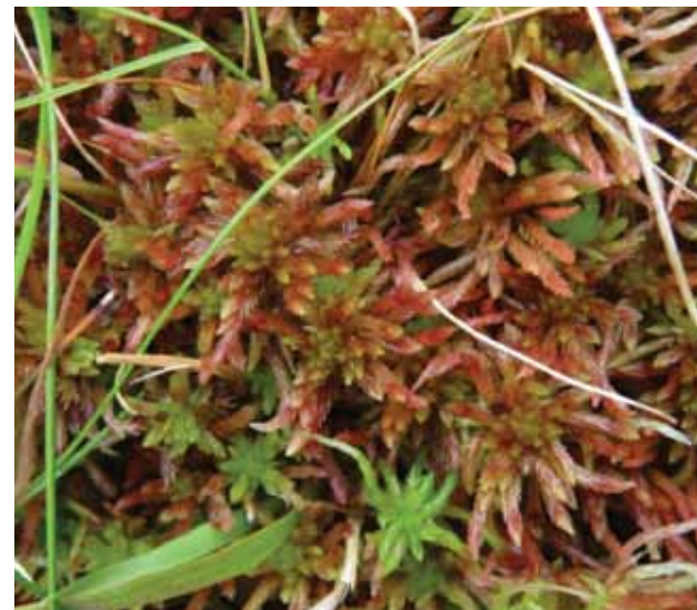
△ Sphagnum skyense from Lough Curra, Galtee Mountains, Co. Tipperary (v.-c. H7). Jo Denyer

1.16. Sphagnum skyense . 102 : in Calluna heath with Adelanthus lindbergianus , 445 m alt., north-east side of Beinn Bheigier, NR43645605, GP Rothero 2011002, conf. MO Hill; H7 : flushed grassland/heath on north-facing