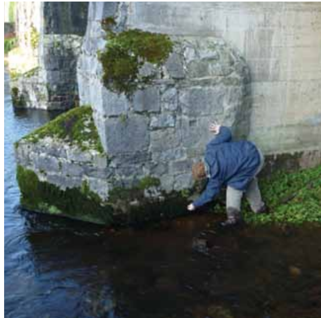
△ Rory Hodd collecting Syntrichia latifolia among Cinclidotus fontinaloides at Kilcullen Bridge, Co. Kildare (v.-c. H19). Jo Denyer

98.1. Leptobryum pyriforme . H21: north-facing coastal cliffs of glacial till with seepage, 10 m alt., Loughshinny, O27065677, 2010, M Lyons; H30: on peaty ground on birch woodland floor, ca 160 m alt., Corleck, Bailieboro, H662027, M Eakin.