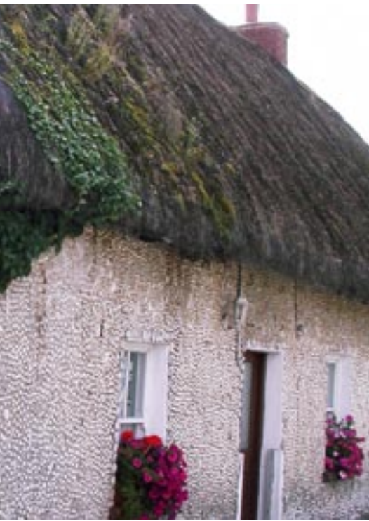
△ Fig. 3. Syntrichia latifolia growing on thatched roof in Co. Wexford. David Holyoak