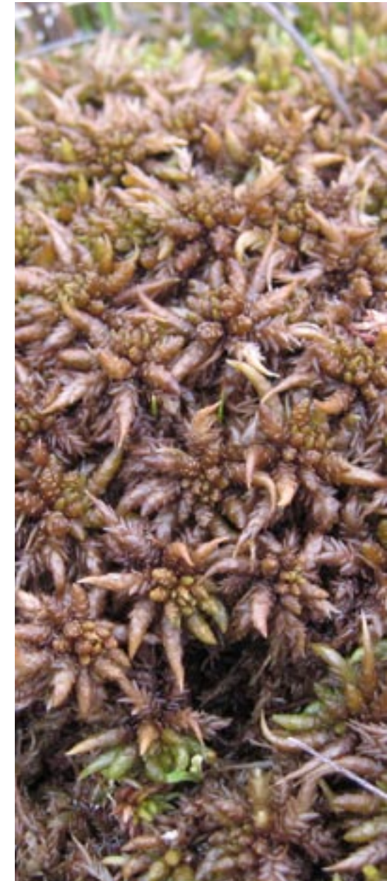
△ Fig. 2. Sphagnum affine in Cumberland; deceptive form resembling S. austini . Fiona Cameron

65.9. Syntrichia latifolia . H12: On old straw-thatch on west-facing roof of cottage, 15 m alt., Blackwater, by main R742 road, T12393401, 2007, Holyoak 07-458A. The species occurs mainly in waterside habitats and it has apparently not been reported previously from thatched roofs. The presence