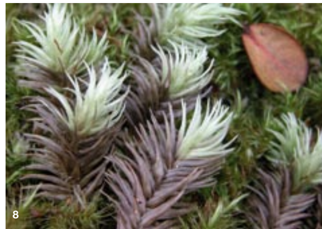
△ 1. Marchantia sp. with gametophores (Jeff Duckett). 2. Brinchang town viewed from the Sam Poh Buddhist temple (Jeff Bates). 3. Pendent Meteoriaceae (Jeff Bates). 4. Sandeothallus , a close relative of Pellia (Jeff Duckett). 5. Pleurozia gigantea (Jeff Duckett). 6. Inside the cloud forest, Gunung Brinchang (Jeff Duckett). 7. Dicranoloma , one of the most conspicuous dicranaceous mosses throughout the Cameron Highlands. (Jeff Duckett). 8. A large species of Leucobryum , found on forest banks in many parts of the Cameron Highlands (Jeff Bates).