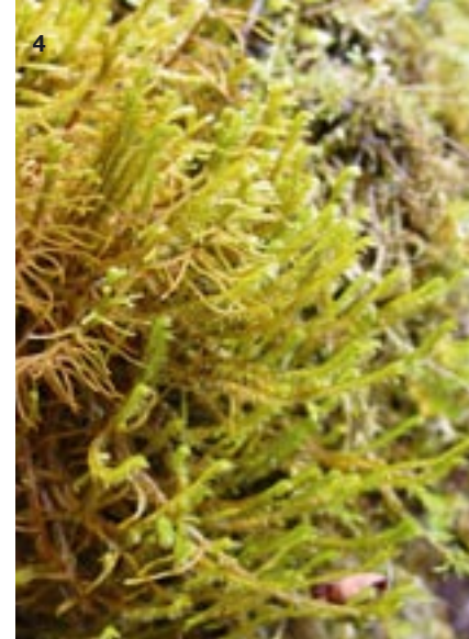
◁ 1. Dendroceros cavernosus . 2. Scanning electron micrograph (SEM) of perforated thallus of Dendroceros cavernosus . Bar, 100 µm. 3. SEM of the reduced (neotonous) gametophyte of Ephemeropsis tijbodensis (Daltoniaceae). The long protonemal spines are orange in colour. Bar, 200 µm. 4. Herbertus and other liverworts.

Many of the cloud-forest bryophytes (e.g. Schistochila , Mastigophora , Lepicolea ) turned out to be quite widespread in the montane forest of the Cameron Highlands. Only Herbertus did we fail to notice anywhere else but Gunung Brinchang and its lofty annexe Gunung Irau. Gunung Jasar (1,670 m) to the west of Tanah Rata, provided a wide range of montane forest bryophytes. These included some strikingly large pendulous mosses (probably Spiridens ) in humid jungle not far from the town, and a fruiting Pogonatum with very reduced leafy shoots, consisting mainly of protonema, on hard earth by trail no. 11. Gunung Berumbun (1,812 m), to the east of Tanah Rata, has reasonably well-developed cloud-forest bryophytes towards its summit. Pendulous Meteoriaceae (e.g. Aerobryidium , Meteorium ) are conspicuous in its