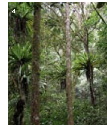
◁ 1. Lepicolea (Jeff Bates). 2. Bazzania pectinata (Jeff Duckett). 3. Schistochila (Jeff Bates). 4. Inside lower altitude montane forest, flanks of Gunung Jasar (path no. 11) (Jeff Bates).