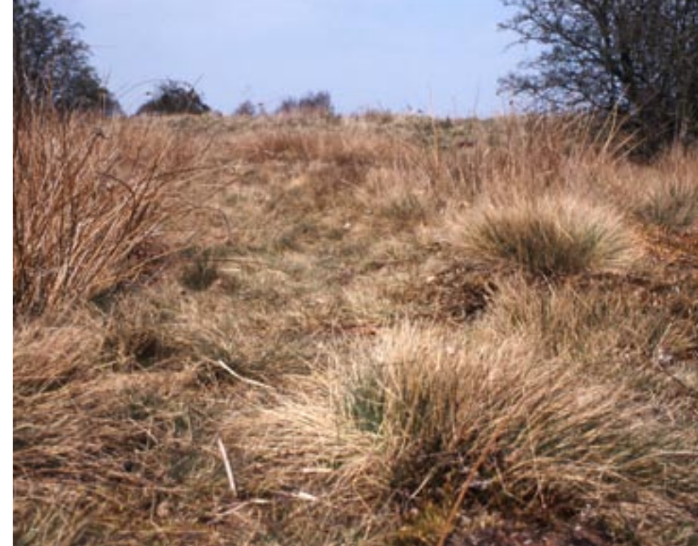
▷ Fig. 5. Wortham Ling, Suffolk, where L. gemmascens grows on the decaying bases of grasses.

The decline of L. gemmascens in some parts of Britain has been noted, but it is more difficult to be equivocal about its rarity in the past compared with today, particularly in view of the lack of early records from grassland. It was known on thatch from Hurstpierpoint, Sussex, from 1845 (first British record) to 1906. At Amberley, Sussex, it was first reported in 1857 with a succession of records up to 1975, spanning a period of 119 years. It is possible that a decline in L. gemmascens records from thatch set in long before bryological recording began. There is evidence of thatch in the Neolithic, and eventually it became the most widespread roofing material on many types of structures, particularly during the medieval period. A general decline in thatch began in the late 18th century, and continued through the 19th and 20th centuries, all but collapsing in the late 1940s and 1950s as a result of shortages of good quality straw, rising labour costs, the availability of cheap alternatives, and loss of skilled craftsmen in two world wars (Letts, 2001). However, the thatching industry has not disappeared; it is estimated that about 24,000 listed buildings in England are thatched (English Heritage, 2000), and new thatched buildings are still being built, for example in Dorset. Thatching practises have also changed, particularly in recent times. There was a phase of replacing wheat straw with reed, although this is now discouraged, and