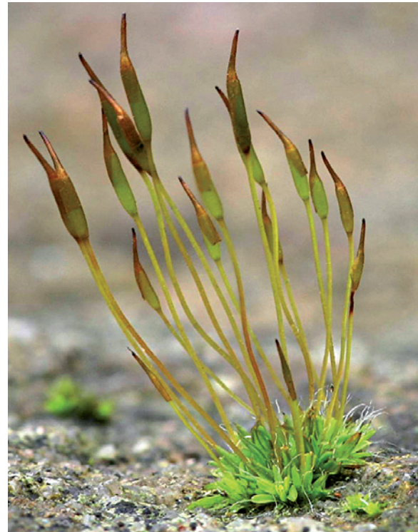
△ Tortula muralis . Des Callaghan

A total of 2,730 records were generated during the survey, all of which have been passed onto the national Biological Records Centre for incorporation into their bryophyte database. I hope that people found the survey enjoyable and that the results presented here help to illuminate an interesting corner of bryological knowledge.