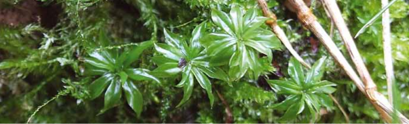
△ Rhodobryum roseum in Penwhapple burn. Ian Atherton

The other main party for the day visited the Country Park, part of the National Trust for Scotland (NTS) property at Culzean (NS2409). Here also it started wet and windy, a decidedly unpleasant combination by the sea. Within a few seconds of our arrival Physcomitrium pyriforme * surfaced at the edge of the Swan Pond car park. Coastal cliffs with ravines supported Plagiochila bifaria and Pterogonium gracile . While much of the well-wooded park was manicured, our list still contained over 100 species, including abundantly fruiting Gyroweisia tenuis on a sandstone block and Oxyrrhynchium pumilum * on a shaded ditch bank.