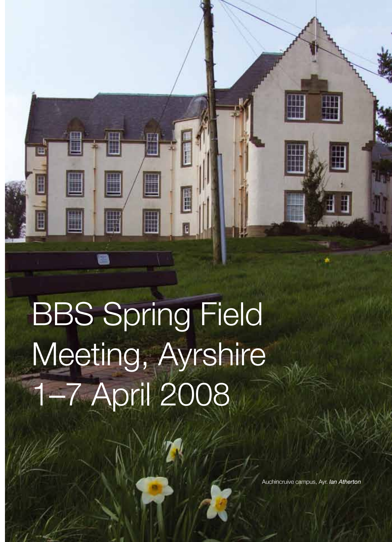
Auchincruive campus, Ayr. Ian Atherton

New Cumnock Cemetery was the first of four such sites visited during the week. Typically, the cemeteries managed by Ayrshire councils are treeless, regimented and manicured, with perfectly cut, precisely edged lawns. They look desperately