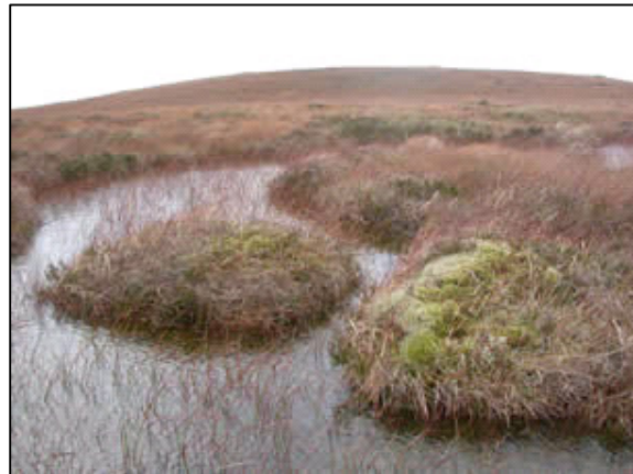
Figure 2: Hummocks and pool complex at the Knockfin Heights, Sutherland.