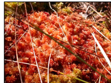
Figure 3: Sphagnum capillifolium