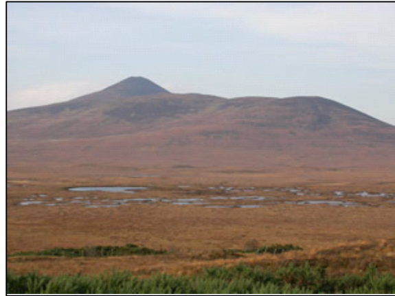
Figure 1: Patterned blanket mire in Scotland's Flow Country, Sutherland.