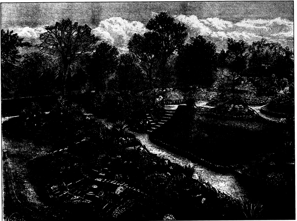
Plate 2b. The Rock Garden after landscaping and planting in the 1860s.