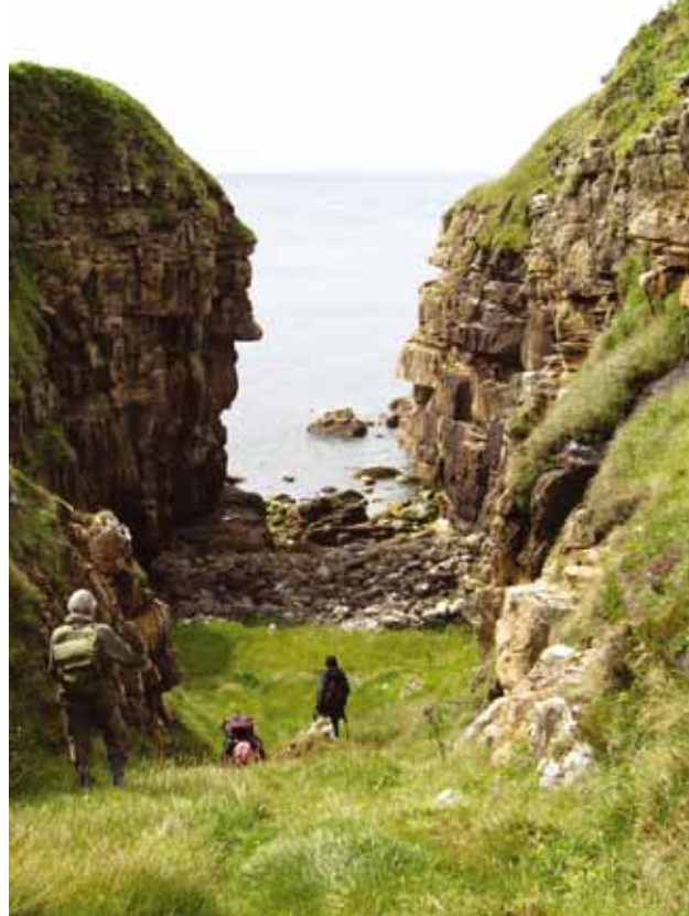
△ Hub, Gordon and Liz in the Chapel Geo. M. Pool

Mark Lawley, Oliver and Clare paid a visit to Beinn Stumanadh, starting recording by Loch Loyal in tetrad NC64J. Due to its good variety of habitats (loch shore, basic flushes, birch woodland, wet heath and both acidic and basic rocks), this tetrad ended the day with the very impressive total of 127 records. It is hard to select highlights as so many good things were found, but perhaps the best