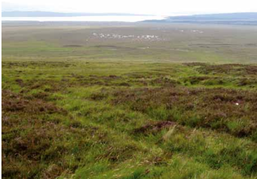
▷ Typical patterned bog near the Garvault Hotel. M. Pool

The second site was Dale Moss, near Westerdale in ND15F, and the roadside to the north. Regrettably, the site had been drained, but a number of bog species still remained ( Campylopus brevipilus , Sphagnum magellanicum , Cephalozia connivens , Mylia anomala , Odontoschisma sphagni , Scapania irrigua and S. umbrosa , among others). The total from here was 45. Following this, the party paid a visit to the urban bryophytes of Halkirk (ND15J); this produced a new vice-county record ( Schistidium crassipilum *, on the bridge) and a debracketing ( Marchantia polymorpha subsp. ruderalis *), together with 37 other species, of which the most unusual were probably Orthotrichum pulchellum , Schistidium rivulare and Syntrichia montana .