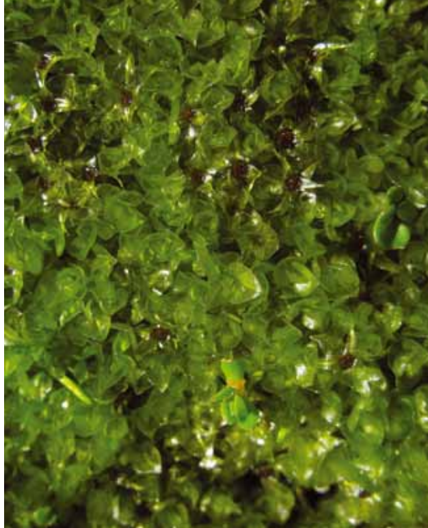
△ Splachnum vasculosum , above Corrie Fee. D.G. Long

Water (NO3052). This is a wooded ravine close to the bryologically rich Den of Airlie so it was hoped that a similar geology would support an interesting suite of species. Unfortunately, the site was rather acidic with little exposed rock and the Loups of Kenny were inaccessible due to the high water level and precipitous and slippery terrain. Dichodontium flavescens * and Conocephalum salebrosum * brought the total for the day to 69 before heavy and persistent rain encouraged a retreat.