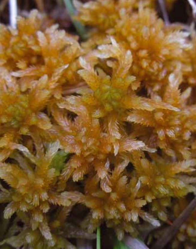
△ Sphagnum contortum on Beinn Stumanadh.