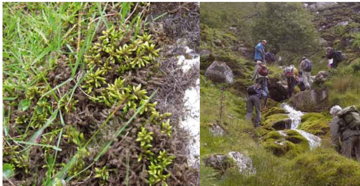
▽ Climacium dendroides on Ben Loyal. M. Pool

latifrons . Sletill Hill produced nothing dramatic, but it added several species which had not been seen in the bogland; highlights were Dicranum fuscescens , Tetraplodon mnioides , Mylia taylorii and Pleurozia purpurea . At the end of the day the total number of species found in hectad NC94 was 107.