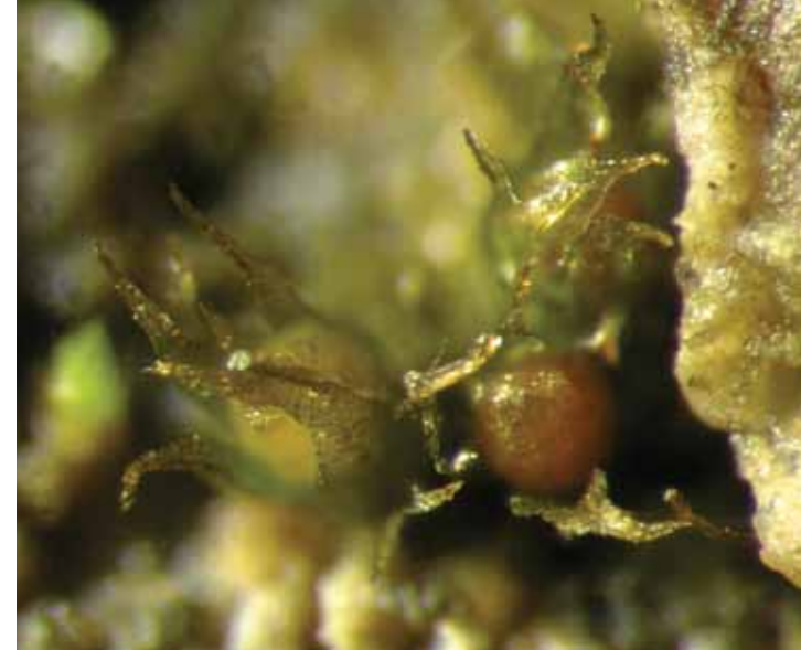
◀ E. cohaerens . Norbert Schnyder (Institut für Systematische Botanik, Universität Zürich)

crinita is almost always found on mortared walls in churchyards in southern France. Many bryophytes are adapted to arable land and some particular species are difficult to spot outside this anthropogenic habitat (for example Dicranella staphylina and Didymodon tomaculosus ). In southern France, Leptophascum leptophyllum is only observed along heavily disturbed paths in or near urban areas, whilst its British occurrences are in arable fields in the south. Rhynchostegium rotundifolium is a specialist of castle walls and is never found in natural biotopes in France, whereas its two British populations are both adjacent to lanes. In these cases, the original and natural habitat can be rather difficult to trace. It is not difficult to see G. crinita as a typical inhabitant of calcareous outcrops, but it is in