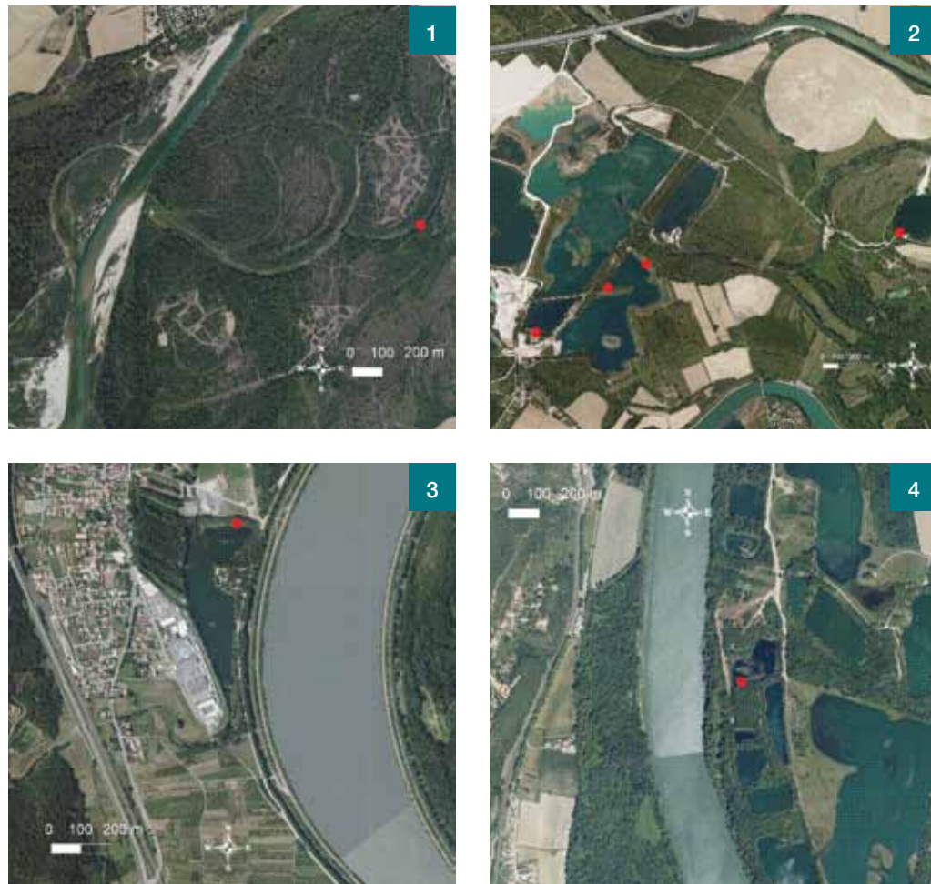
▽ Fig. 1. Location (red dots) of E. cohaerens populations in the Rhône valley. 1, Ain confluence; 2, Miribel-Jonage; 3, Tournon sur Rhône; 4, Canal de Montélimar.

status of the habitats although they are reputedly naturally quite eutrophic (Rodwell, 2000).